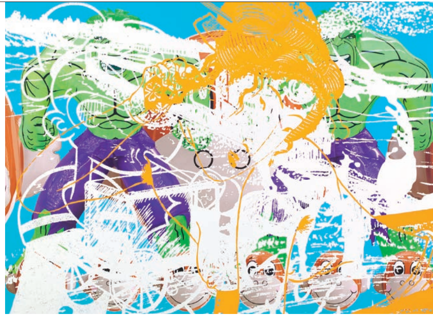
CURTAIN’S UP The enormous Geisha , part of the “Hulk Elvis” series, served as the backdrop for the Vienna State Opera in 2007–08.

Most public sculpture is a dubious proposition; it just can’t compete with nature or architecture. Koons’s Puppy is the single greatest work of public sculpture made after Rodin that I’ve seen. I once spent 10 days in Bilbao, where the first of the litter permanently resides, its flowered tongue delicately hanging out of its mouth directly in front