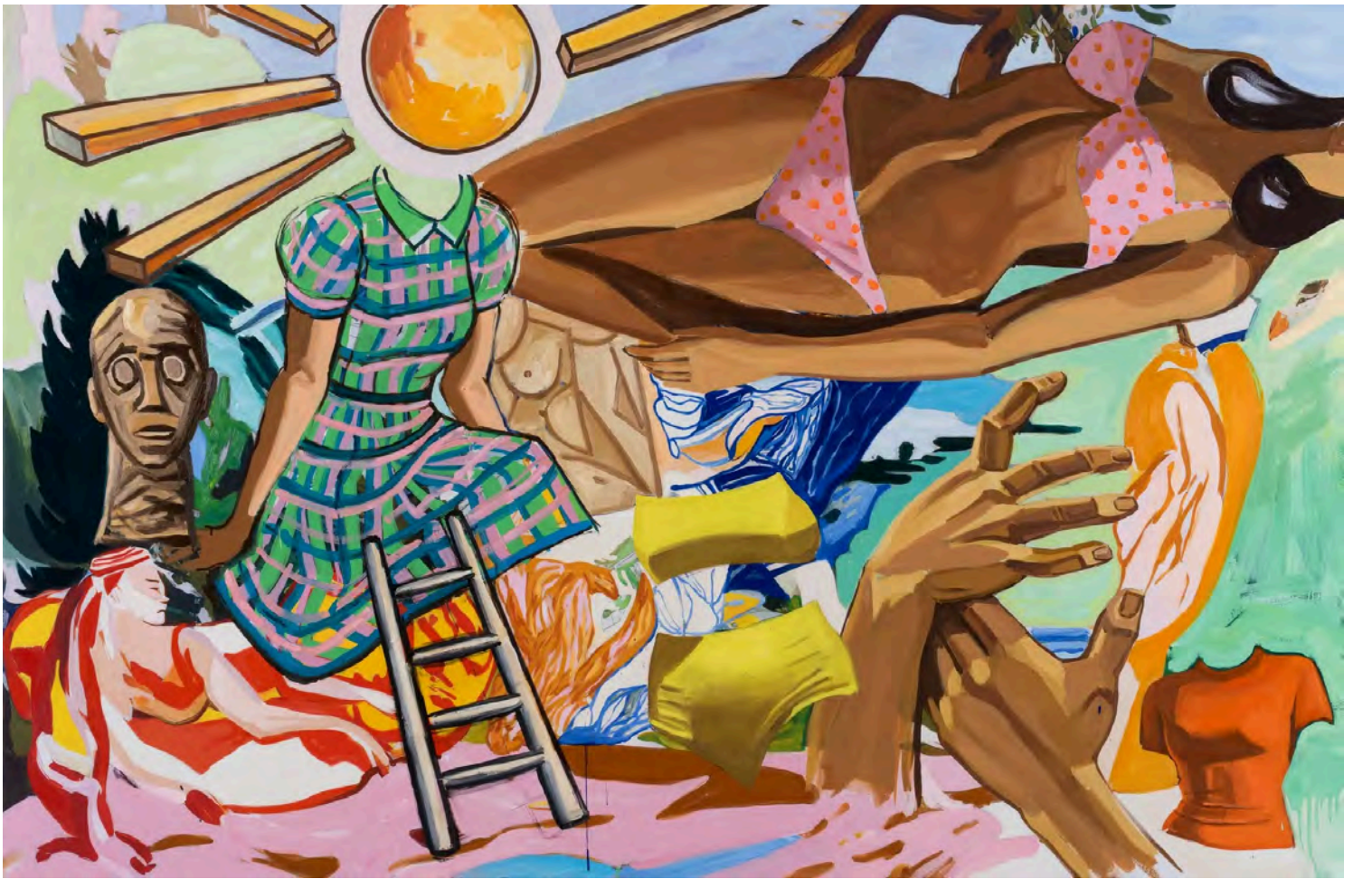
“New Pastoral With Ladder,” 2024. The artist layered paint over his collaborator’s uncanny valleys — which are really his own, presented back to him through a shattered fun house mirror.

Salle jokes that he sent the program to art school, teaching it how a painting works by feeding it a balanced diet of his favorites — Arthur Dove for line, Edward Hopper for volume, De Chirico for space, Warhol for color — as well as his own “Pastorals,” before administering a final exam. He effectively reverse engineered a David Salle painting.