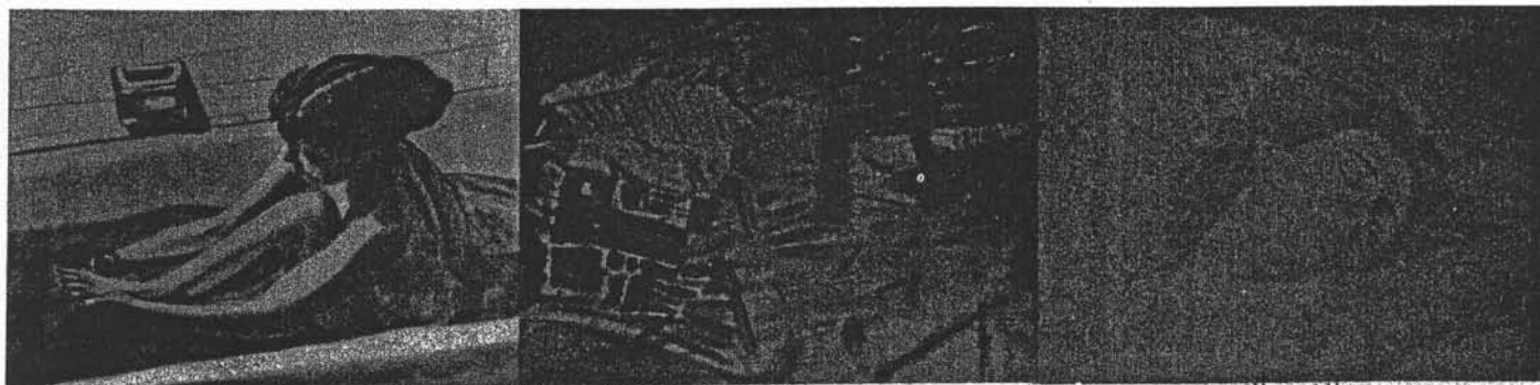
David Salle, Long Intervals of Time and Years, 1981, acrylic on canvas, 62" x 80".