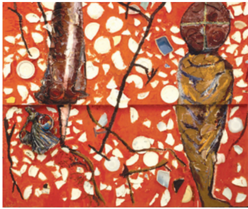
Julian Schnabel, Lolita , 1980, oil, plates, and Bondo on wood, 96 x 84".

As with other painters of his generation, Julian's aesthetic has always been about the freest and most surprising juxtaposition of images and an ability to see images and pure form as part of the same continuum. What set his work apart was his use of a fragmented, physically demanding surface, which gave his version of free association a kind of flickering, tentative quality that insists on the materiality of the painting. In this new film, we can feel the same aesthetic impulses at work. It flickers too. The gorgeous light that passes through the window and makes Jean-Do's curtains glow is the artist's material. Subjective experience and narrative come together in his movie's astringent and luscious gaze.