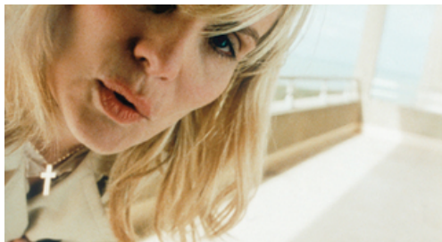
Julian Schnabel, The Diving Bell and the Butterfly , 2007, still from a color film in 35 mm, 112 minutes. Céline (Emmanuelle Seigner).

In films about damaged people there is always a scene in which the director tries to connect us to the protagonist’s struggle to regain a lost capability—an attempt to walk again, relearn speech, and so on. These scenes, these movies, almost never work. Apart from The Miracle Worker (1962), Julian’s is the only one that actually made me feel I was experiencing the hero’s struggle. Jean-Do’s vibrant speech therapist, Henriette, played with great humility by Marie-Josée Croze, devises a way for him to “speak” by blinking at the correct letter as she recites the alphabet with the letters arranged in order of the frequency of their use. Julian’s patient camera allows us to participate in real time as, one letter after the next, Jean-Do and Henriette construct the words and phrases that reconnect him to society and, eventually, compose his book. As his caregivers and Céline, the mother of his children but not the love of his life, master the system of “talking” with him, we instinctively race ahead to link up letters to spell the next word. It’s a strange dialogue: Jean-Do’s “voice” emerges from his interlocutors. This transference is so absorbing, so suspenseful to watch, that I forgot I don’t speak French.