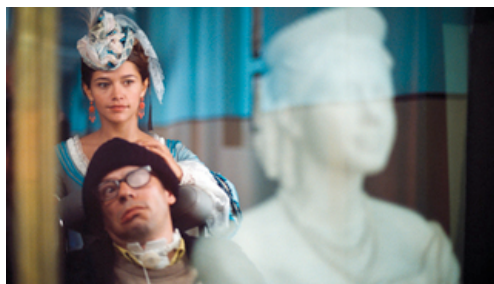
Julian Schnabel, The Diving Bell and the Butterfly , 2007, still from a color film in 35 mm, 112 minutes. Jean-Dominique Bauby (Mathieu Amalric) and Empress Eugénie (Emma de Caunes).

DAVID SALLE ON THE DIVING BELL AND THE BUTTERFLY